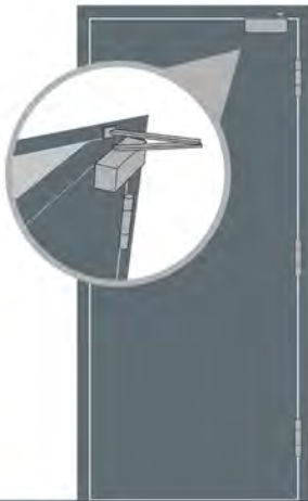
Conventional commercial hinges and overhead closer